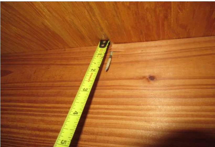
8d nails verified