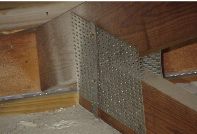
Single strap with at least 3 nails into the truss