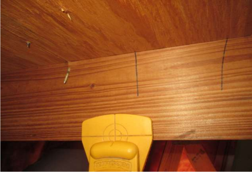
Nail location verified